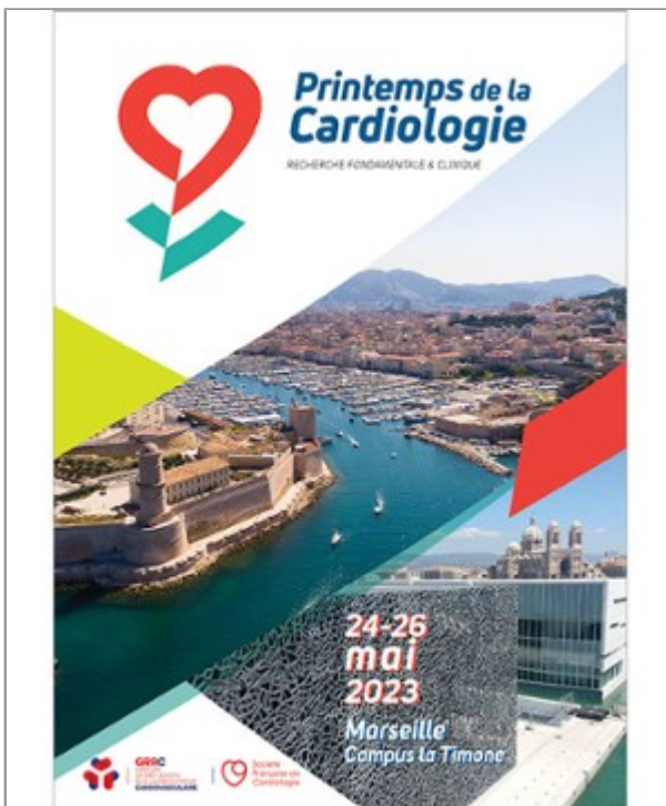
Printemps de la cardiologie - Marseille