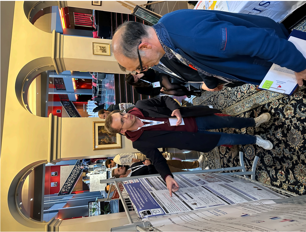
Poster Nervana ISSA